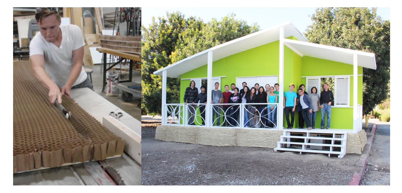
Figure 5. Students shown making panels, and with the finished Full-scale mockup

Students were eager to develop, prototype, and test the most crucial aspects of a design. Communicating design intent often requires methods of demonstration rather than simulation. The value of the built prototype on campus has immeasurable value for this ongoing project; we view it as a malleable entity that will be ideal for future testing and analysis which can be continually added to and modified. The course focused on prototyping as a means to learn as well as to inform the ongoing optimization. Students designed details and built the project at all levels, from site preparation to gluing and preparing of each panel, to final finished construction such as painting and hanging doors (see Figure 5).