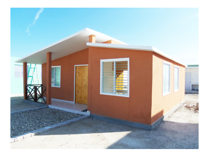
Figure 1. The Takit-EZ House as built at the Haiti Housing Exposition in Port au Prince will become a permanent home for a Haitian family after the exposition closes

ing. The work has resulted in an initial prototype section of a house constructed at the University campus in the United States and the first full house completed in Haiti (see Figure 1).