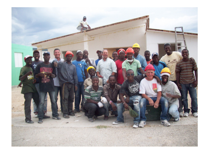
Figure 2. Haitian Factory and site-build team

The implementation of the entire project was realized through a series of courses that spanned an academic year. The process of designing and building the prototype house involved a close col-