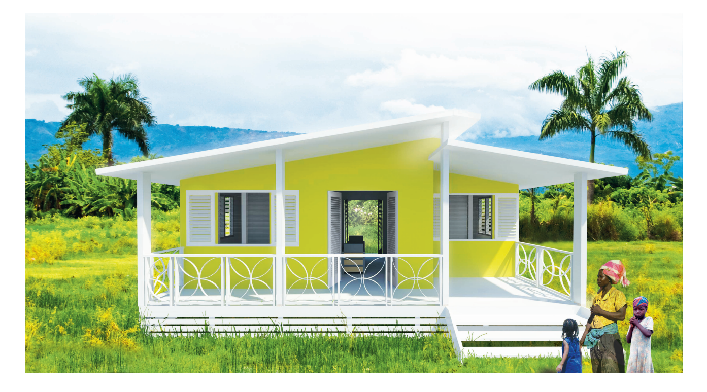
Figure 3. Rendering of the Selected Design – the Takit-EZ House

Next the design was optimized in terms of affordability, structural, sustainability, and constructability issues.